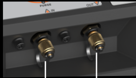
3/8" Inlet Port 1/4" Outlet Port