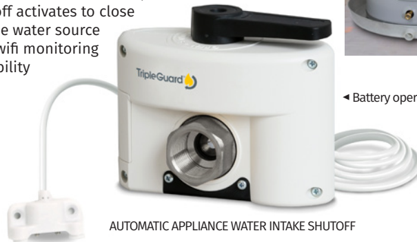
AUTOMATIC APPLIANCE WATER INTAKE SHUTOFF