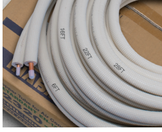
Malleable copper tubing and insulation easily shapes to fit any application.