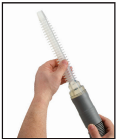
Quickly installs to clean 3/4" lines & 1"