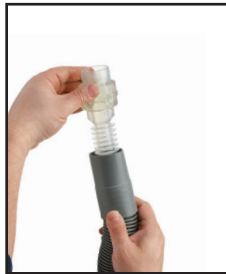
Flips around for larger drains