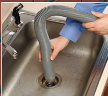
Use on a large variety of drains and lines