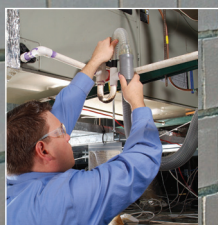
Perfect for condensate drain lines

– or over – drains and hoses for condensate lines, pumps and more. It's safer than compressed air or CO 2 and uses your regular wet/dry vacuum . And when the job's done, it's small enough to fit in most tool boxes or anywhere you keep your tools.