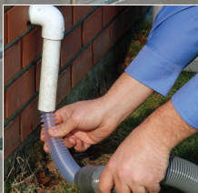
Fits standard 3/4" and 1" drain lines