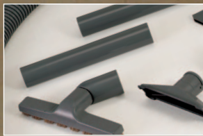
Multiple accessories available