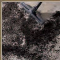
Chunky or fine pickup