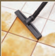
Quickly clean wet surfaces