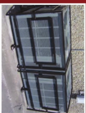
Two ACGU Units with locks

Your unit is wider than 51"? NO PROBLEM! Just purchase two cages and mount side by side!