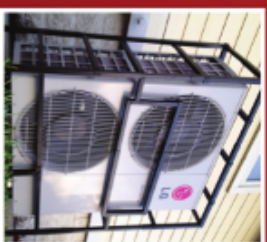
ACMS - Mini-Safe Security Kit