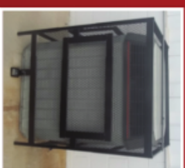
MACGU Kit - Mega Kit w/ optional Expanded Metal

Your unit is wider than 51"? NO PROBLEM! Just purchase two cages and mount side by side!