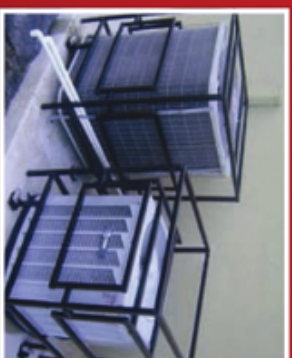
2 ACGU KITS w/extra bar (ACB)