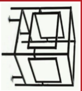
ACGU - 1" steel framework