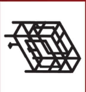
ACMS KIT - 1" steel framework