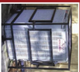
ACGU - Original AC-Guard Unit