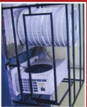
ACGU KIT w/extra bar (ACB) on top