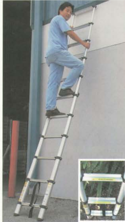
Patent in China. US patent pending

The Magic ladder is lightweight and requires minimal space for storage or transport.