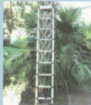
The Magic Ladder