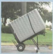
The Lift Dolly ESC

FIND OUT ABOUT OUR OTHER UNIQUE PRODUCTS: