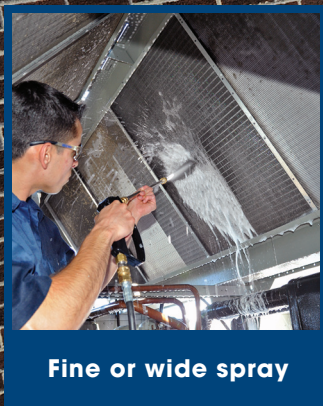
Fine or wide spray

The FlowJet connects to a water source to deliver a continuous spray of water and cleaning chemical to wash even the dirtiest coils, without damaging sensitive fins. And the optional Wonder Wand lets you clean coils from the inside out – a proven method for increasing coil cleaning and system efficiency. Now that's smart.