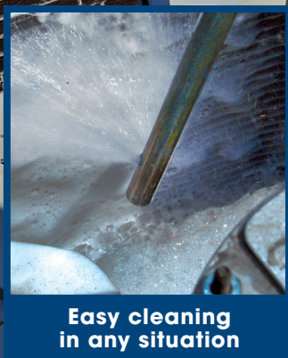
Easy cleaning in any situation