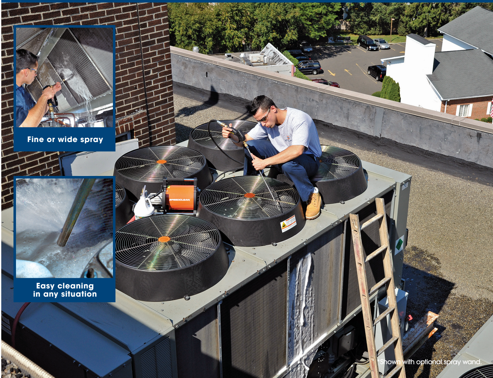
*Shown with optional spray wand.