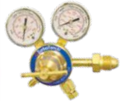
Standard Regulator 245-03P (0386-0814)