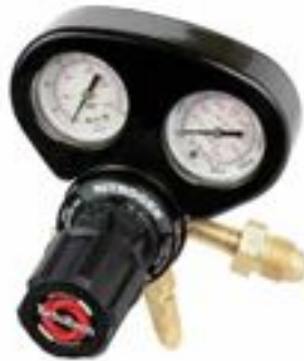
High Pressure Regulator 250-800-580 (0386-0857)