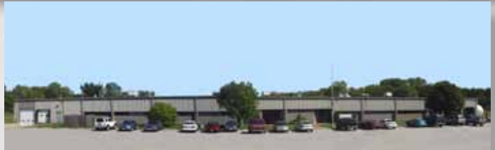
East Moline, IL

Demonstrating our further commitment to becoming the leader in line set manufacturing, JMF offers a dedicated facility to manufacturing line sets. Our unique manufacturing method is what allows us to always ship 3 weeks or less. We can also build custom line sets to fit your needs.