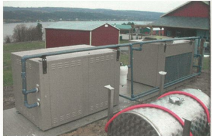
Dairy farm application