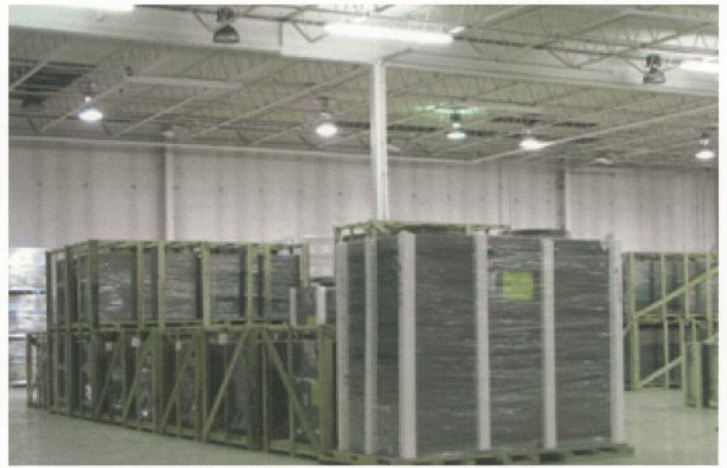
Extensive chiller stocking program for immediate delivery needs