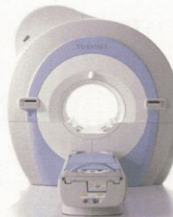
M.R.I. magnetic cooling

“Drake Chillers represent the most high-quality, durable, standard units on the market with cooling capacities ranging from 1 to 106 tons and are available for quick delivery.”