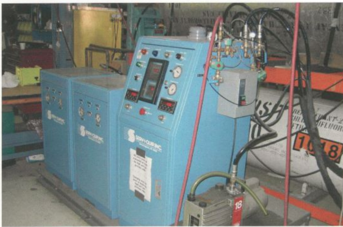
State-of-the-art evacuation, vacuum charging station