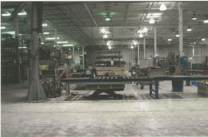
80,000 square foot manufacturing facility in Bensalem, PA